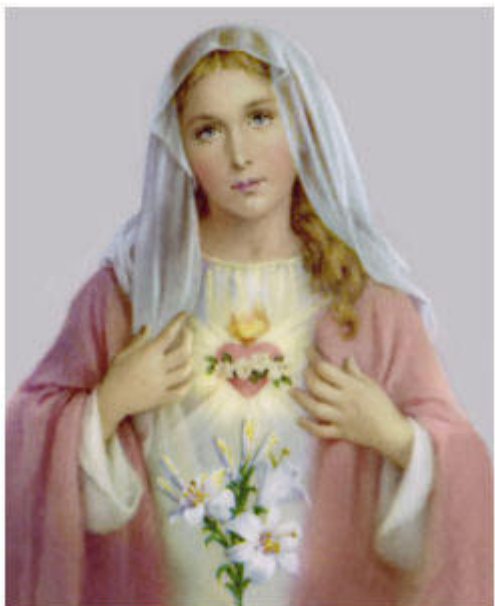
August - The Month of the Immaculate Heart of Mary