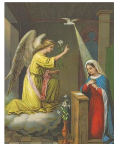
Annunciation - March 25 th Anunciación, 25 de marzo