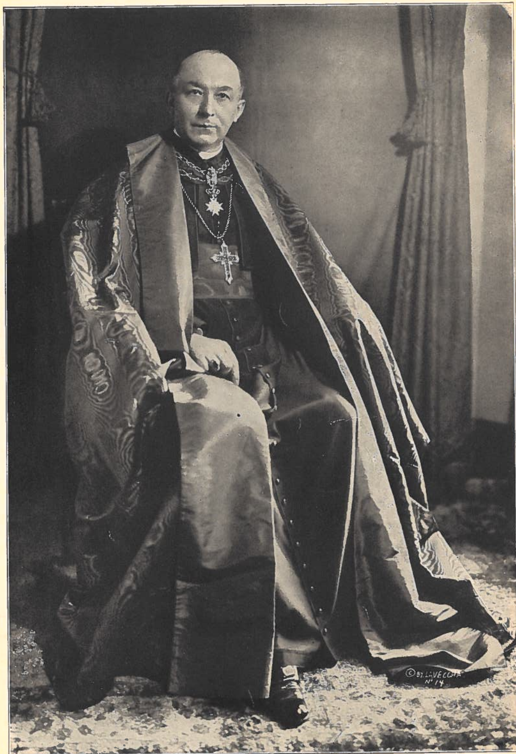
HIS EMINENCE GEORGE CARDINAL MUNDELEIN