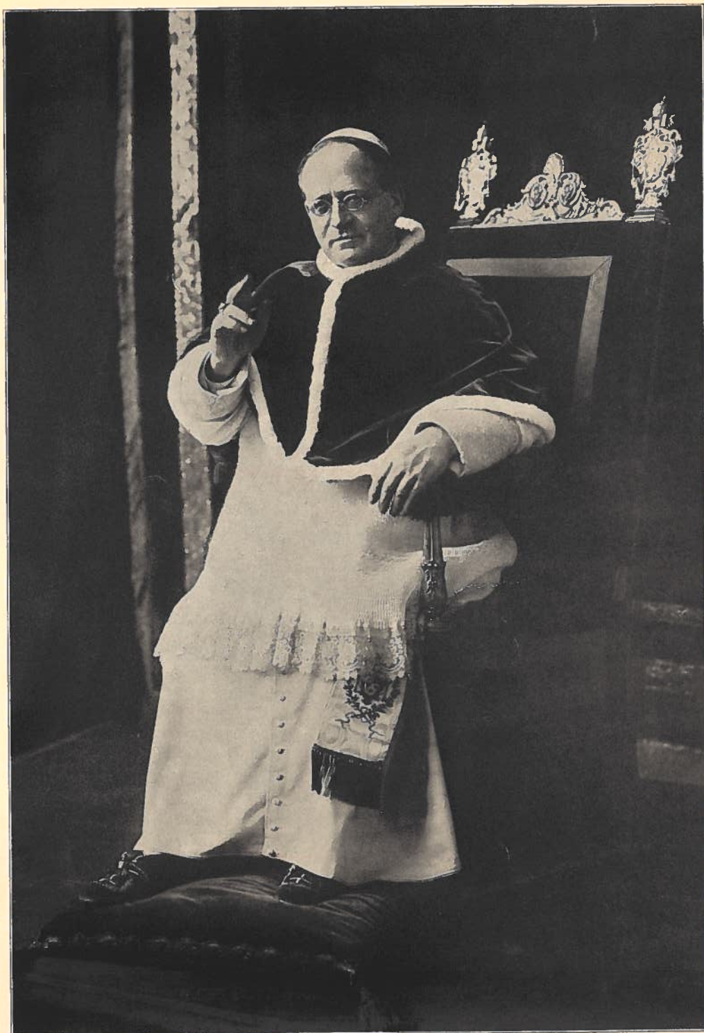
HIS HOLINESS POPE PIUS XI, GLORIOUSLY REIGNING