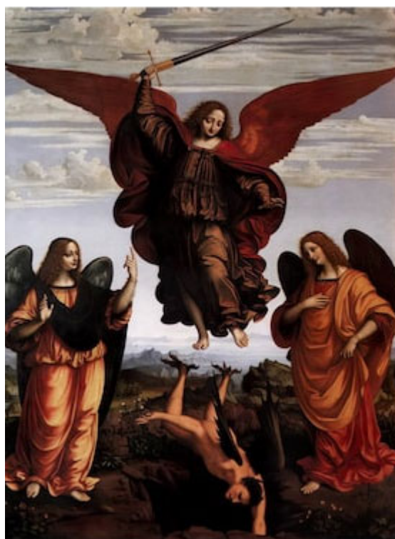
Saints Michael, Gabriel & Raphael, Archangels September 29